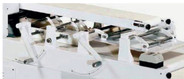
Detail of the adjustable pressing device